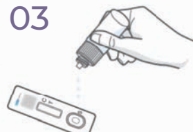
Apply Sample On Test Device