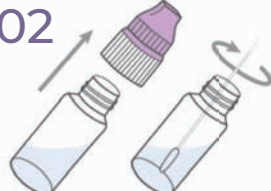
Insert Swab & Stir